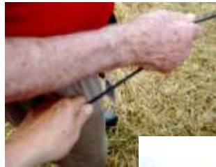
Everyone lined up to get a hand on the long lanyard for a good old fashion artillery "Gang Bang!!" Know what I mean?