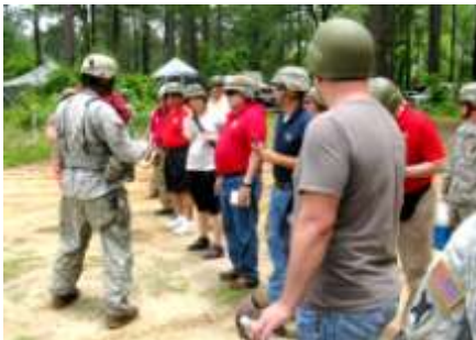
Everyone was outfitted with a Kevlar and hearing protection

Everywhere the WAVA members went they drew the attention of the gun crews.