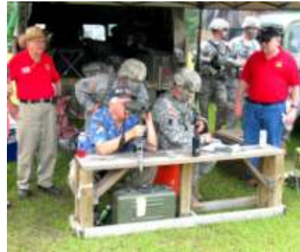
An FO "want-a-be" takes a sighting, with the "Viper" range finding binoculars, on a potential target for a fire mission

Out in the impact zone, the rounds make their presence known with clouds of smoke and some muffled thumps