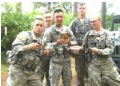
Lunch was some of Uncle Sam's finest MREs. Everyone was impressed with the endless choices on the "carte du jour"