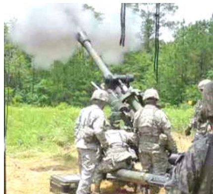
They call it Smokeless Powder but there was plenty of smoke to go around if you wanted to get a nose full