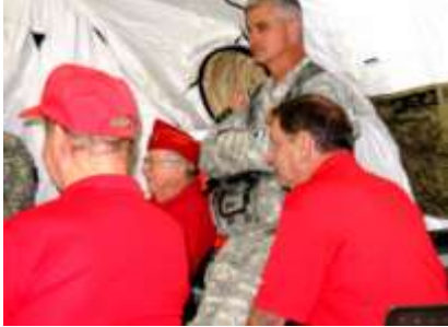
A briefing in the Field Command Center

The Battalion invited WAVA members and members of ESGR (Employer Support of the Guard and Reserve) to attend their Annual Training at Camp Shelby, MS. Also in attendance were three employers supporting ESGR. For details of the event, please refer to the Commander's Comments. Here in, we are just going to give you a snapshot view of some of the things we saw at the AT.