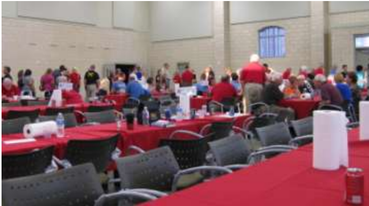
(Note the “chow hounds” wrapped around the room.)

The WAVA Seafood Social was one for the record books. 198 people were served their fill of crawfish, shrimp, oyster, catfish, potato salad, boiled corn and potatoes. Oh yes, there was bread pudding for dessert. The lucky winner of the Half & Half drawing took home $295.